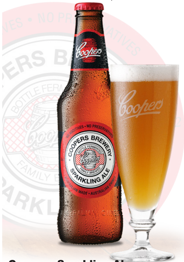
Coopers Sparkling Ale